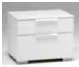
STYLE OF BEDSIDE TABLES