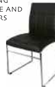
STYLE OF DINING TABLE AND CHAIRS