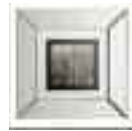
STYLE OF PRINTS