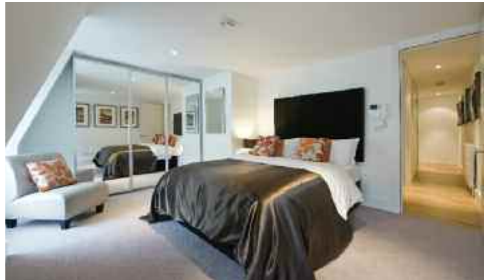
STYLE OF DIVAN BED AND HEADBOARD