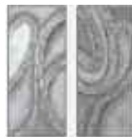
STYLE OF RUG