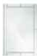
STYLE OF MIRROR