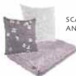
SCATTER CUSHIONS AND THROW