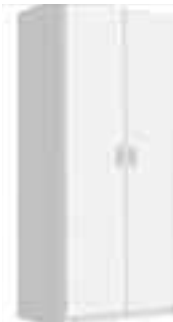
STYLE OF WARDROBE