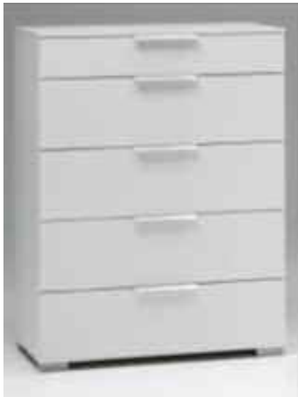
STYLE OF CHEST OF DRAWERS