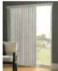
STYLE OF WINDOW TREATMENTS