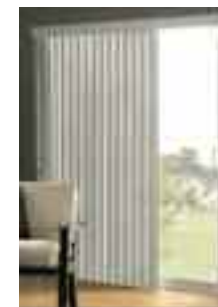
STYLE OF WINDOW TREATMENTS