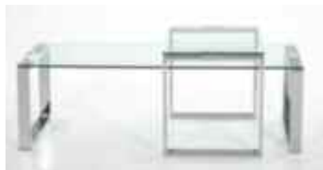
STYLE OF COFFEE AND OCCASIONAL TABLE