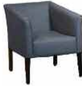
STYLE OF TUB CHAIR