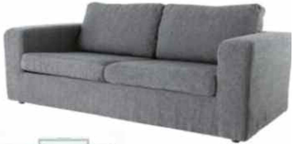
STYLE OF SOFA AND ARMCHAIR IN GREY FABRIC