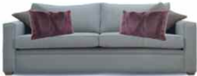
STYLE AND FABRIC OF SOFA