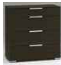
STYLE OF CHEST OF DRAWERS