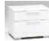
STYLE OF BEDSIDE TABLES