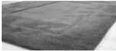
STYLE OF RUG