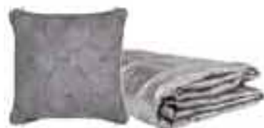
SCATTER CUSHIONS AND THROW