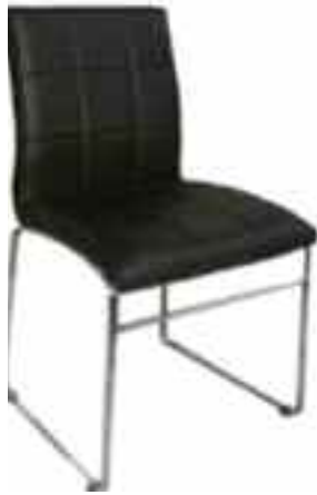
STYLE OF DINING TABLE AND CHAIRS