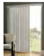
STYLE OF WINDOW TREATMENTS