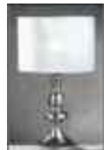
STYLE OF TABLE LAMP