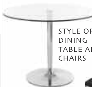
STYLE OF DINING TABLE AND CHAIRS