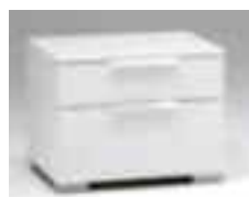
STYLE OF BEDSIDE TABLES