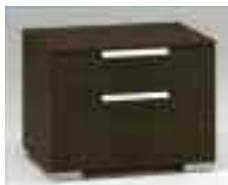
STYLE OF BEDSIDE TABLES