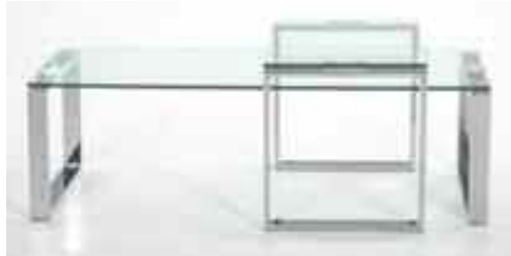
STYLE OF COFFEE AND OCCASIONAL TABLE