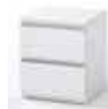
STYLE OF BEDSIDE TABLES