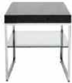
STYLE OF COFFEE & OCCASIONAL TABLES